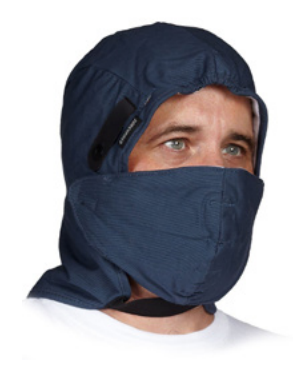
WINTER HARD HAT LINER WITH FACE MASK

Flame retardant blue cotton outer shell with quilted cotton flannel interior. Black leatherette loop straps with Velcro chin strap.