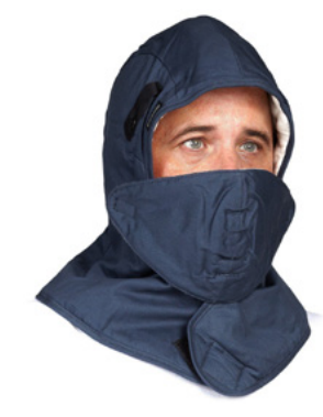
OVERSIZE QUILTED COTTON HARD HAT LINER

Liner with face mask. Both liner and mask are black nylon exterior with quilted cotton fleece inner lining. Mask attaches with Velcro strips.