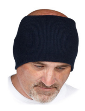
NAVY BLUE ACRYLIC HARD HAT LINER

Liner with face mask. Both liner and mask are black nylon exterior with quilted cotton fleece inner lining. Mask attaches with Velcro strips.