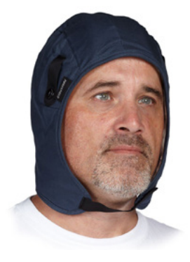
QUILTED COTTON HARD HAT LINER, FLAME RETARDANT