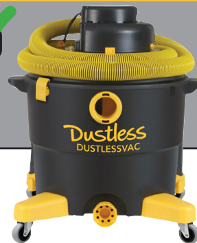
Wet+Dry DustlessVac ® (Model D1603) 130 CFM