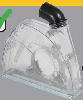
CutBuddie Dust Shroud (7" Model D1750)