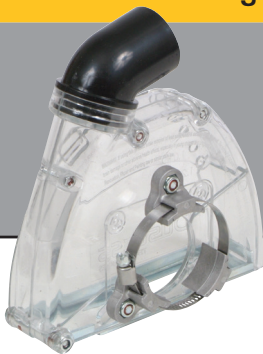
CutBuddie Dust Shroud (5" Model D1730)