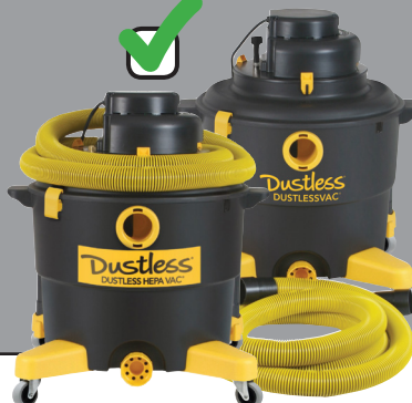
Wet+Dry DustlessVac ® (Model D1603) + HEPA Wet+Dry DustlessVac ® (Model D1606)* 260 CFM