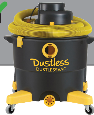
Wet+Dry DustlessVac ® (Model D1603) 130 CFM

When grinding with a 7" - 9" angle grinder and a grinding wheel up to 7"