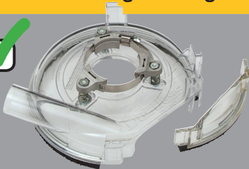
DustBuddie Dust Shroud (7" Model D1850)