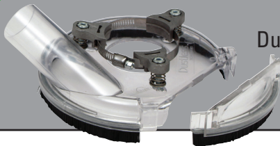
DustBuddie Dust Shroud (5" Model D1835)