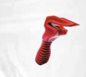
Patented double-bladed ZipperKnife<sup>™</sup> sheeting cutter prevents zipper jams!