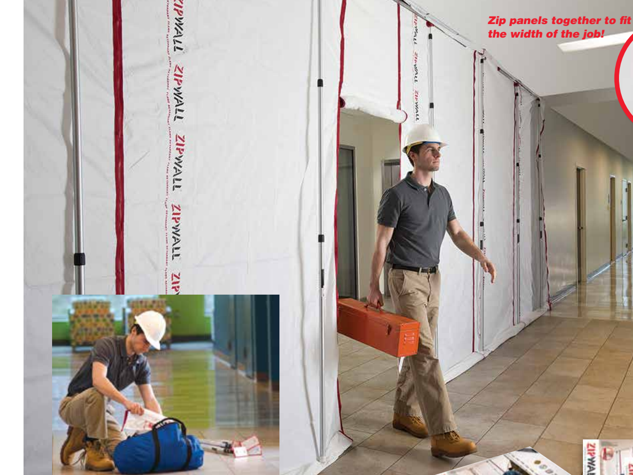
REUSABLE BARRIER PANELS