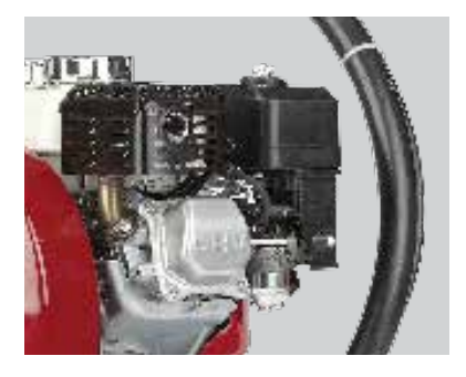
Convert from Gas to Electric Power Easily convert from Electric to Gas power. No tools required.

These high-performance, heavy-duty paint sprayers use long-stroke, slow-cycling hydraulic piston technology for economical operation and dependable, long-term spraying.