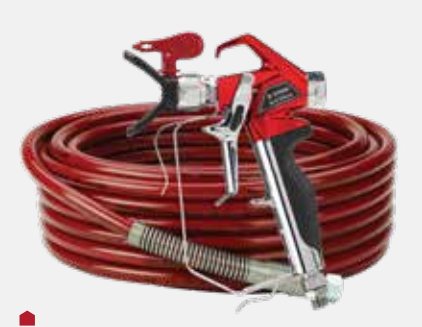
The Impact 1140 comes with an RX-Pro Gun, 517 TR<sup>1</sup> Reversible Tip and 1/4" x 50' Airless Hose.