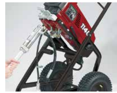
EasyOut<sup>™</sup> Fluid Section T-slot piston and release mechanism makes removal fast and easy. Available on the Impact 1140 only.