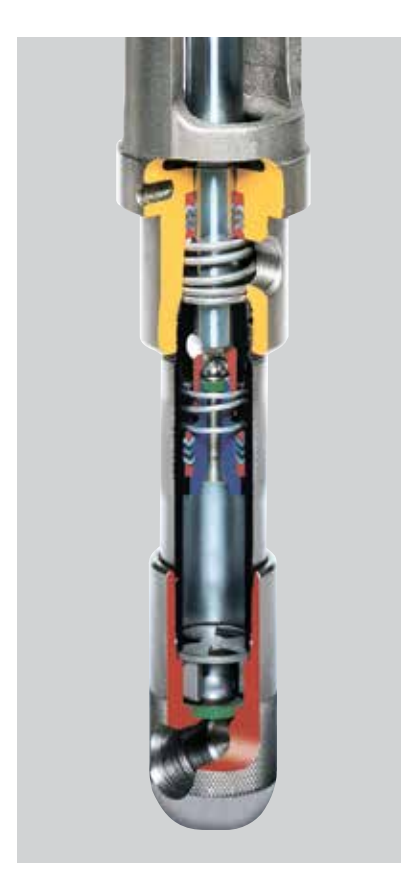
Severe Service<sup>™</sup> 900 Pump Cylinder and piston rod are tempered with a proprietary heat-treating process that increases pump life 150% over competitive pumps. Self-adjusting packings resist over-tightening and help prevent premature wear.