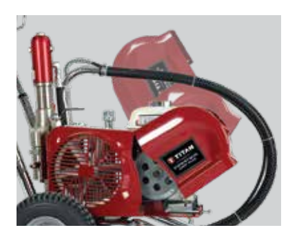
Belt Guard Easy access for converting from electric to gas power.