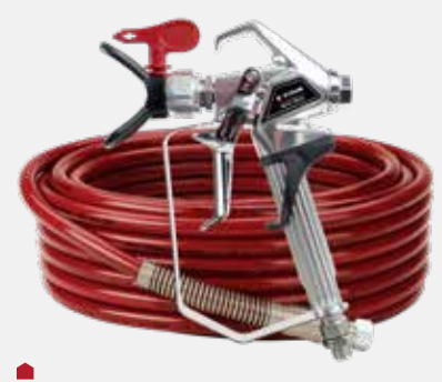
The Impact 440 comes with RX-80 Gun, 517 TR1 Reversible Tip and 1/4" x 50' Airless Hose.