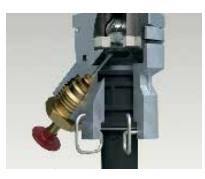
Sureflo<sup>™</sup> Pusher Valve Primes the first time, every time. Unstick the lower ball valve with a push of a button. No need for a hammer.

DigiTrac<sup>™</sup> Integrated Digital Display Advanced diagnostics, set actual working pressure readings, resettable gallon and run time counter and more. Available on Impact models 640, 840, 1140 & 1640.