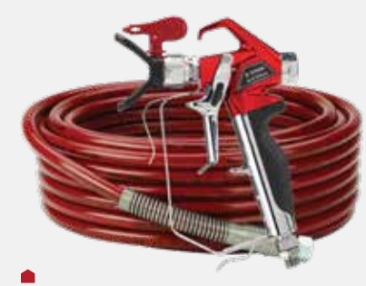
The Elite 3000 comes with RX-Pro Gun, 517 TR^1 Reversible Tip and 1/4^{\prime\prime} x 50' Airless Hose.