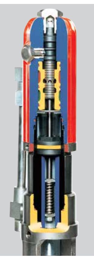
Speeflo® HydraDrive™ Smooth, slow-stroking hydraulic drive provides extreme power and reliability.