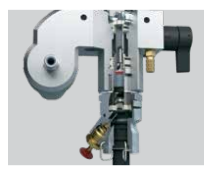
Quad+ Packings<sup>™</sup> / Permalife<sup>™</sup> Cylinder

Business is demanding and you need the kind of performance you get from Titan sprayers. It's time to invest in the expanded features and performance that will make a major IMPACT on your profit margin.