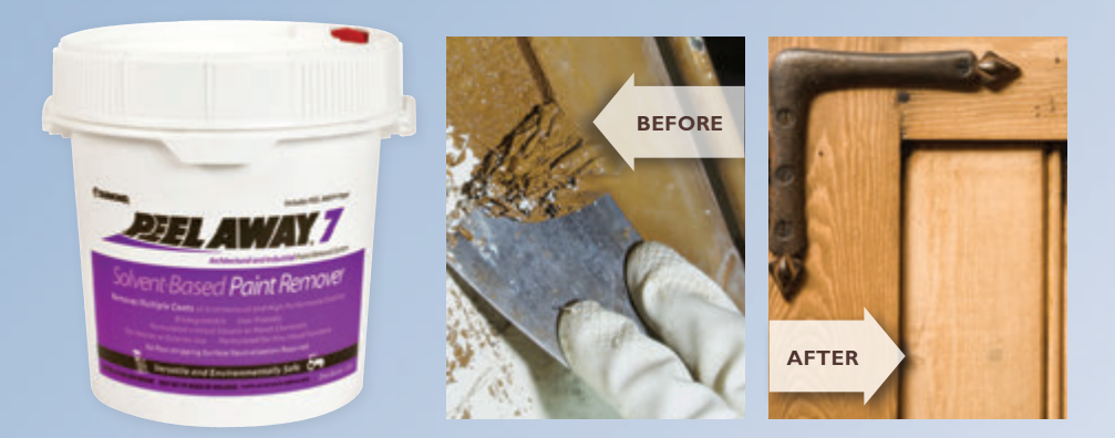
GAL-7001, 5 GAL-7005, 8 oz Sample

User friendly — does not contain methylene chloride or caustic. Safely removes multi-layers of paint and varnish from decorative hardwoods without discoloration or raising the grain. Effectively removes most high performance and elastomeric coatings. Safe for use on any interior/exterior surfaces. Available in Gallons and 5 Gallon Pails.