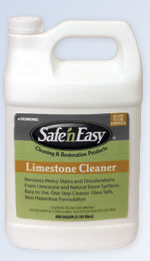
GAL-10900, 5 GAL-0900, 8 oz Sample