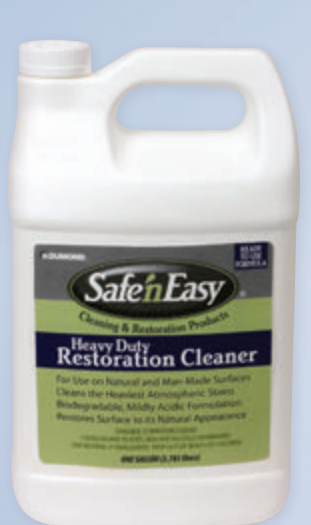
GAL-0998, 5 GAL-0999, 8 oz Sample