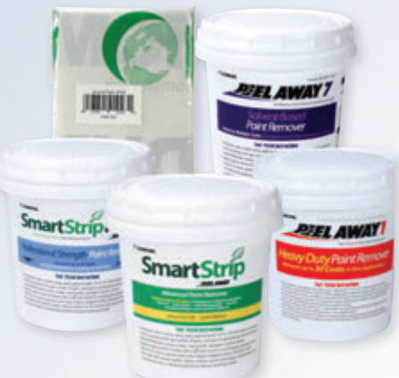
Available for purchase on our website www.dumondchemicals.com