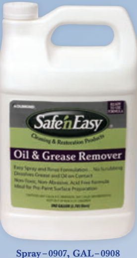
5 GAL-0909, 8 oz Sample