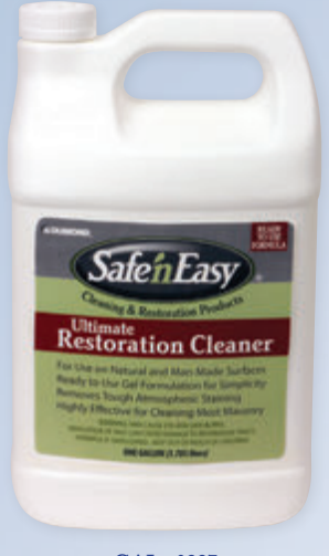
GAL-0997 5 GAL-0996 8 oz Sample

has been engineered to penetrate beneath the surface into porous concrete, asphalt and masonry surfaces. It does not sit on top of surfaces like other cleaners. Usual dwell time is three hours and it can then be either pressure washed or hosed off. No scrubbing is required. Available in Gallons and 5 Gallon Pails.