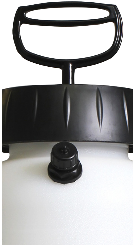
48oz. lightweight handheld sprayers