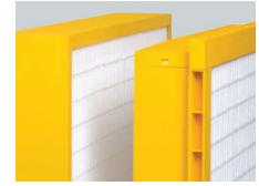
Available in both box style and single header design