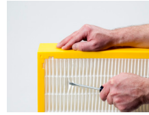
Durable media pack resists damage