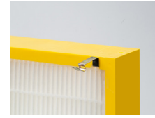
Shown with 2" clip designed to hold an optional pre-filter