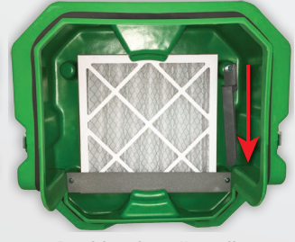
Position for 2" prefilter