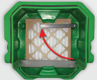
Position for 1" prefilter