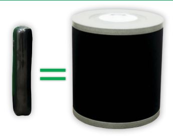
Foam pre-filter for cylinder