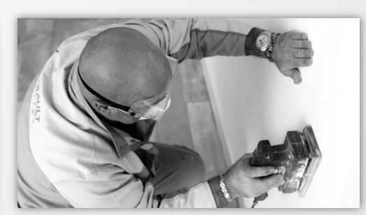
Renovation & Restoration