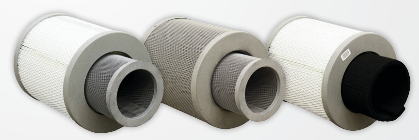
Shown with interior activated carbon cylinder/blanket protruding for demonstration purposes only.